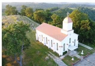
Saint Joseph Mission 64 Frohnapfel Lane Proctor, WV 26055