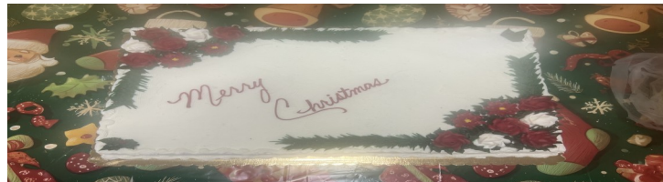
St. Joseph's Christmas Party in the Snow with Santa! #Blessings