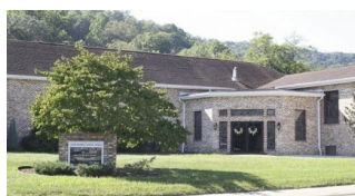
Mater Dolorosa Parish 302 East Main Street Paden City, WV 26159