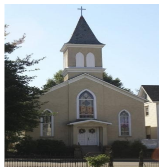
Holy Rosary Mission 519 Main Street Sistersville, WV 26175