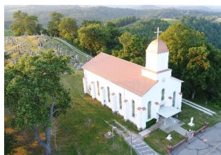
Saint Joseph Mission 64 Frohnafel Lane Proctor, WV 26055