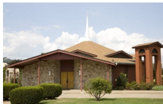
Saint Vincent de Paul Parish 21 Rosary Road New Martinsville, WV 26155