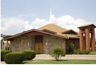
Saint Vincent de Paul Parish 21 Rosary Road New Martinsville, WV 26155