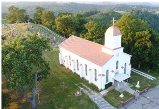
Saint Joseph Mission 64 Frohnäpfel Lane Proctor, WV 26055