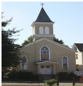
Holy Rosary Mission 519 Main Street Sistersville, WV 26175