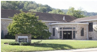
Mater Dolorosa Parish 302 East Main Street Paden City, WV 26159