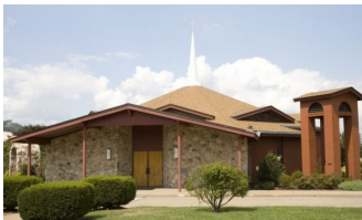
Saint Vincent de Paul Parish 21 Rosary Road New Martinsville, WV 26155