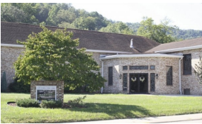
Mater Dolorosa Parish 302 East Main Street Paden City, WV 26159