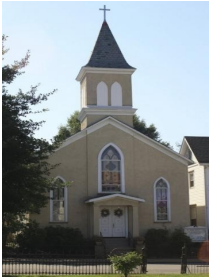
Holy Rosary Mission 519 Main Street Sistersville, WV 26175