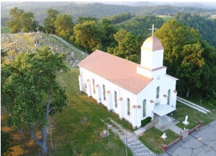
Saint Joseph Mission 64 Frohnafel Lane Proctor, WV 26055