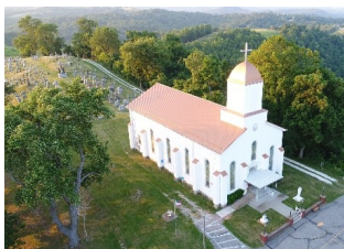
Saint Joseph Mission 64 Frohnäpfel Lane Proctor, WV 26055