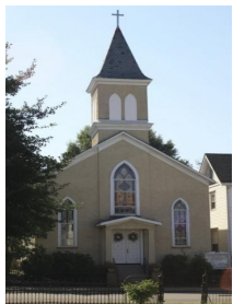
Holy Rosary Mission 519 Main Street Sistersville, WV 26175