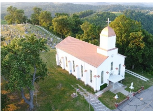
Saint Joseph Mission 64 Frohnafel Lane Proctor, WV 26055