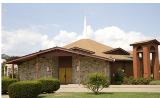
Saint Vincent de Paul Parish 21 Rosary Road New Martinsville, WV 26155

The LORD is my light and my salvation; whom should I fear?