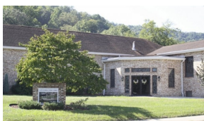
Mater Dolorosa Parish 302 East Main Street Paden City, WV 26159