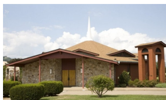
Saint Vincent de Paul Parish 21 Rosary Road New Martinsville, WV 26155