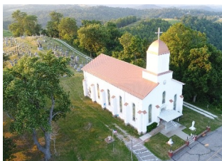
Saint Joseph Mission 64 Frohnafel Lane Proctor, WV 26055