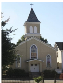
Holy Rosary Mission 519 Main Street Sistersville, WV 26175