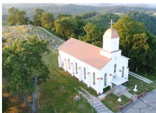
Saint Joseph Mission 64 Frohnappel Lane Proctor, WV 26055