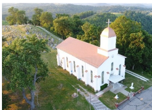
Saint Joseph Mission 64 Frohnappfel Lane Proctor, WV 26055