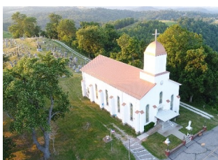
Saint Joseph Mission 64 Frohnapfel Lane Proctor, WV 26055