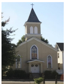
Holy Rosary Mission 519 Main Street Sistersville, WV 26175