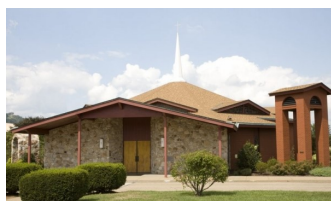
Saint Vincent de Paul Parish 21 Rosary Road New Martinsville, WV 26155