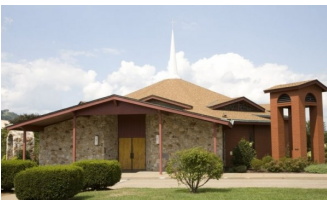
Saint Vincent de Paul Parish 21 Rosary Road New Martinsville, WV 26155