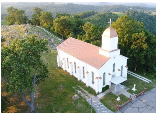
Saint Joseph Mission 64 Frohnapfel Lane Proctor, WV 26055