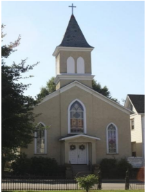
Holy Rosary Mission 519 Main Street Sistersville, WV 26175