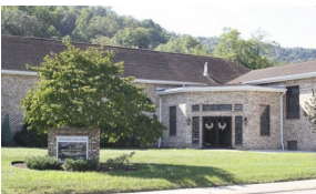
Mater Dolorosa Parish 302 East Main Street Paden City, WV 26159