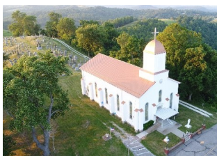
Saint Joseph Mission 64 Frohnafel Lane Proctor, WV 26055