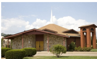
Saint Vincent de Paul Parish 21 Rosary Road New Martinsville, WV 26155