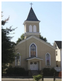
Holy Rosary Mission 519 Main Street Sistersville, WV 26175